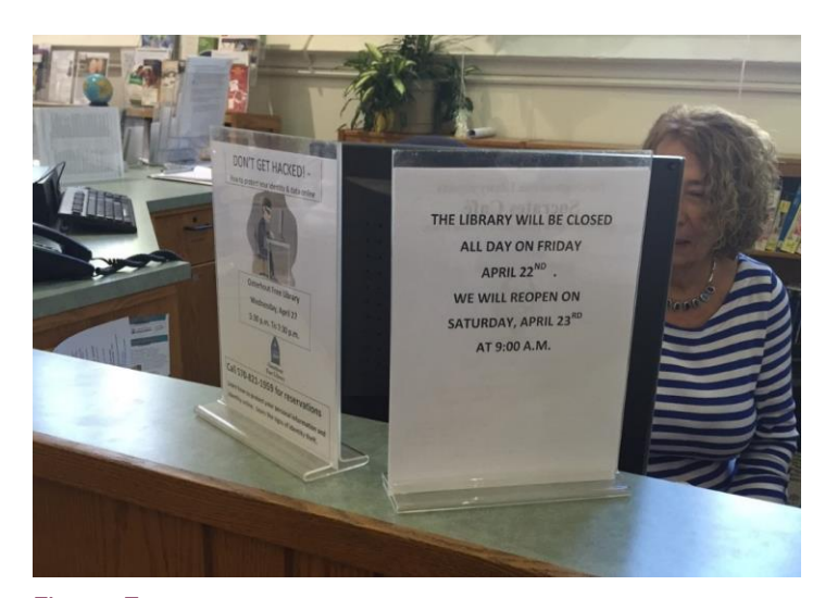
Figure 7 The hidden librarian

Is there a physical barrier to communication, such as a computer, positioned between the employee and the customer at the service desk? Does the location of the computer at the service desk require the employee to sit with their back to the counter, thus, requiring the customer to first gain the employee's attention before making a request? This may make the customer feel that they are interrupting the employee. Small changes to the arrangement of computers and desks can have a huge impact on improving customer service by making communication easier.