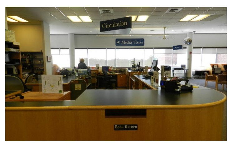
Figure 6 Who will help the customer?

Is there a physical barrier to communication, such as a computer, positioned between the employee and the customer at the service desk? Does the location of the computer at the service desk require the employee to sit with their back to the counter, thus, requiring the customer to first gain the employee's attention before making a request? This may make the customer feel that they are interrupting the employee. Small changes to the arrangement of computers and desks can have a huge impact on improving customer service by making communication easier.