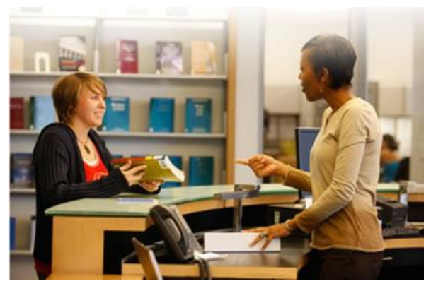
Figure 4 Modeling good communication at the service desk

Attention to one's own communication skills is a good place to begin finding areas for improvement. Model appropriate communication skills before telling others how to improve their communication skills. When observing library employees note eye contact, body placement, and facial expression. Are staff members looking at the customer or looking at a computer or other electronic device? Eye contact clearly shows attention to the speaker. Have they positioned their body so that they are facing toward or away from the customer? Angling the body away may be a sign that the conversation is not welcome. Are they encouraging the customer to speak by nodding or asking follow-up questions? Are the follow-up questions appropriate? Facial expressions should match the tenor of the situation rather than express emotions indicating that they want the customer to stop talking or go away.