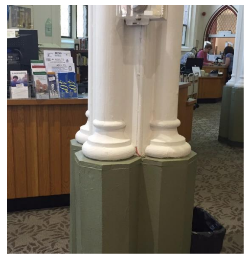
Figure 5 Obstructed view of the circulation desk

Observing how the library space contributes to or detracts from good communication is also an important element in improving communication with customers. When customers enter the library, can they make eye contact or even see a library employee?