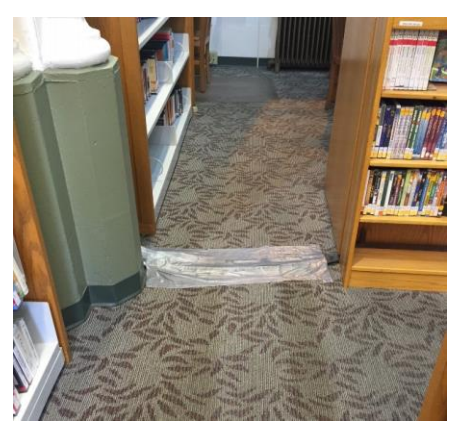
Figure 3 Duct tape covering electrical cords may be hazardous

Examine the condition of the rest of the library and look for areas of concern. Are there stains on the carpet? Is there enough light in all areas of the library? Is the furniture in good working order? Ensuring that furniture and fixtures are in good shape prevents the library from having a dilapidated appearance or even unsafe conditions. Make easy repairs and plan for repairs that represent significant cost by including costs in the next budget. The key to keeping these items in good working order is regular inspection and repair, not simply reacting when a customer expresses frustration that a chair has been broken for six months.