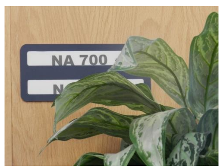
Figure 2 Obscured call number sign

aid, the call number signs must be visible, legible, and accurate but will also benefit from the inclusion of the subject area. Confirm that call number signs are in order and fix any problems to ensure a good customer experience.